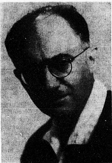
Abraham Sutzkever, who reads from his poetry in Yiddish on February 20 here at the Y.